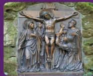
Come pray at The Grotto's Outdoor Stations of the Cross