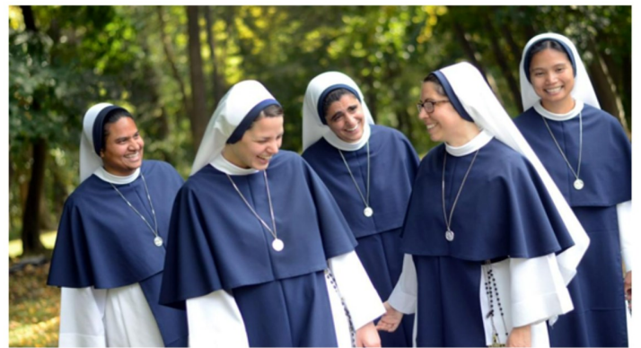
Sisters of Life - Lenten Mission in Oregon February 15 - 18

The Sisters of Life invite you to join them for their upcoming events around Oregon!