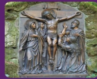
Come pray at The Grotto's Outdoor Stations of the Cross

The National Sanctuary of Our Sorrowful Mother (The Grotto) is located at NW 85th and Sandy Blvd in Portland