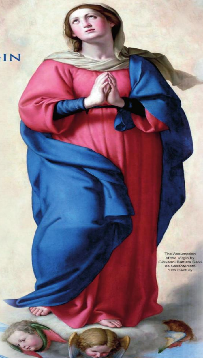
The Assumption of the Virgin by Giovanni Battista Salvi da Sassoferrato 17th Century