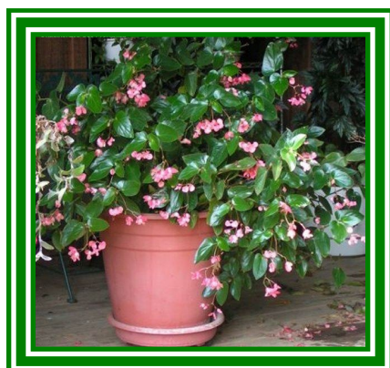
DRAGON WING BEG