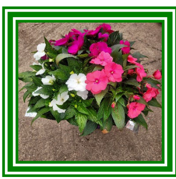
NEW GUNEA IMPS.