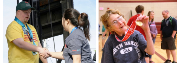
Participants receiving medals at a State Special Olympics event

Every year, several local councils have organized and prepared meals for numerous Special Olympics North Dakota events including state competition and local/area events. It's estimated that in the last twelve years, the Knights of Columbus has helped prepare and serve more than 21,500 meals at our Special Olympics North Dakota state competitions. Knight of Columbus are important fundraisers for our organization conducting breakfasts, selling raffle tickets, tootsie rolls and so much more. Members of several Knight of Columbus councils came aboard when Special Olympics North Dakota hosted the North America Softball Championships in Bismarck in 2017. Participants from numerous US States and Canadian provinces were served by Knights as they stepped up to be day of event volunteers, organizers of Olympic-town, and leaders of the Walk of Champions.