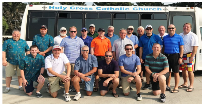
West Fargo Holy Cross Council 9642 with 21 golfing members

As mentioned earlier the tournament was very successful again this year, thanks to all of you. We hope that you will again come and support the Knights of Columbus Foundation Golf Tournament next year.