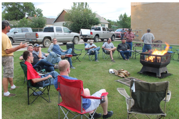
Seminarians enjoyed a time for relaxation as part of the Seminarian Getaway: Unload and Unwind.