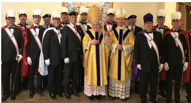
Fargo Assemblies 788 and 3589 take part in the Cardinal Burke Mass at Sts. Anne and Joachim Church during his visit to Fargo in April.