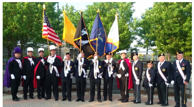
Joining together, the Fargo Assemblies stand honor guard at Memorial Day services in Fargo.