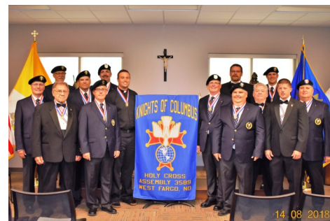
2018-2019 West Fargo Assembly 3589 officer installation