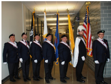
The 4th Degree Knights have served as the color guard during opening ceremonies at each state competition going back beyond 2006.