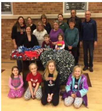
Casselton Council 9477 Knights with their families who worked together to make blankets for the Veteran Blanket Project.

Blankets can be any design and color you choose and be 40" x 60" in size. Lap size is also appreciated.