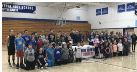
Group picture from 2019 State Knights of Columbus Free Throw Contest.