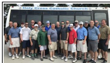
West Fargo Holy Cross Council #9642 brought 6 teams (24 guys) to Carrington for the Golf Tournament