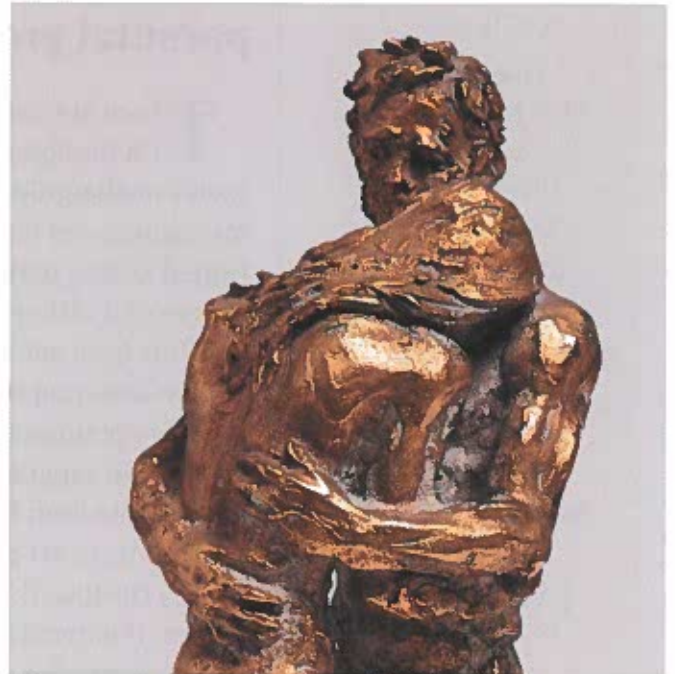
Piece: Prodigal Son , 1956