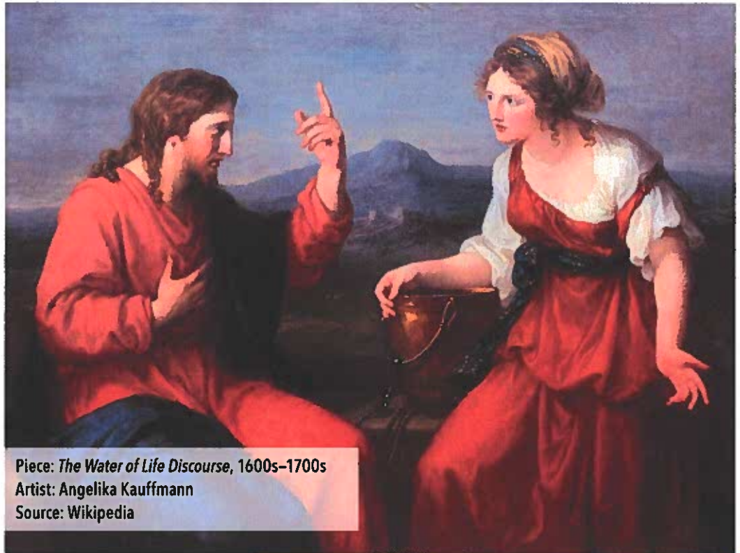
Piece: The Water of Life Discourse , 1600s–1700s