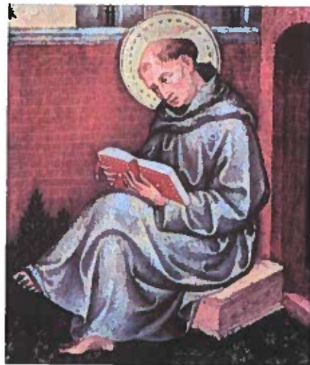
DETAIL (THOMAS AQUINAS) FROM WALLE RONITTA POLYTYCH BY GENTILE DA FABRIANO (CIRCA 1400)

These doctors proved themselves to be trustworthy guides for both protecting and developing the great treasure that is our faith.