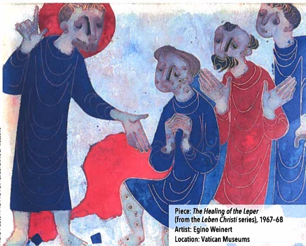
Piece: The Healing of the Leper (from the Leben Christi series), 1967-68 Artist: Egino Weinert Location: Vatican Museums