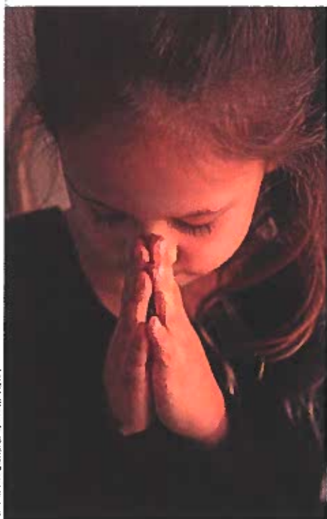
APR 04 11:00 AM - J 11:00 AM