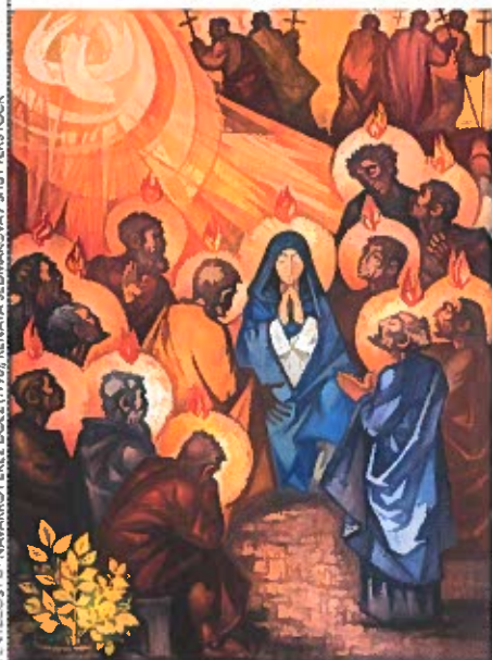
PENTECOST BY NAVARRO PEREZ DOLZ (1990).