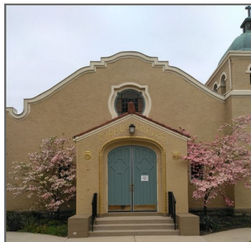
Corpus Christi Church