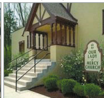
Our Lady of Mercy Church