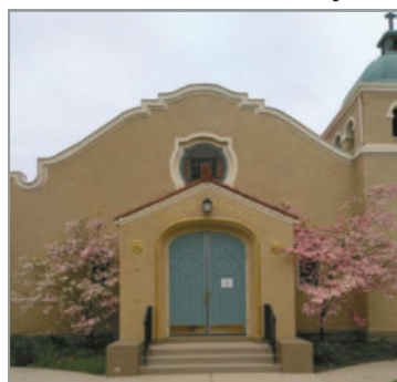
Corpus Christi Church