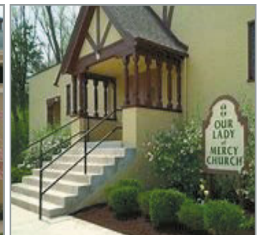
Our Lady of Mercy Church