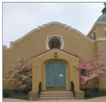
Corpus Christi Church