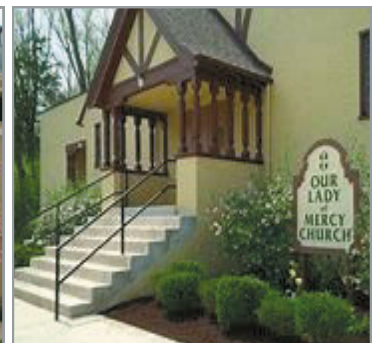
Our Lady of Mercy Church