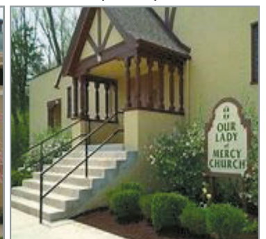
Our Lady of Mercy Church