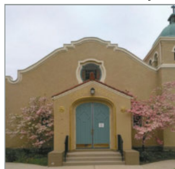
Corpus Christi Church