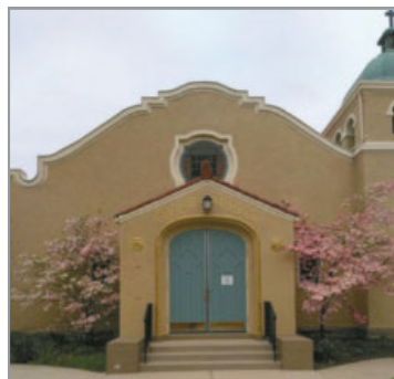
Corpus Christi Church