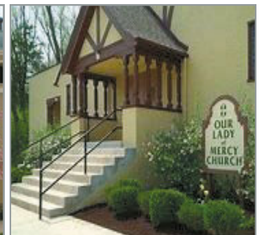
Our Lady of Mercy Church