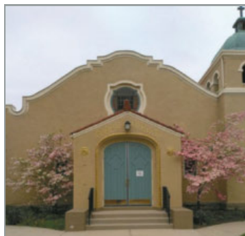
Corpus Christi Church