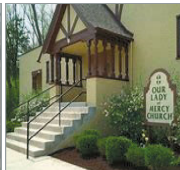
Our Lady of Mercy Church