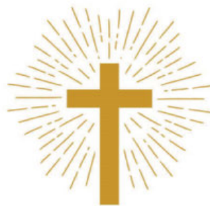
Easter Vigil at SB 2024