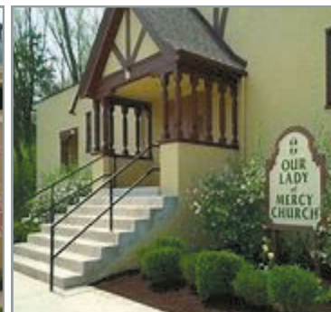
Our Lady of Mercy Church