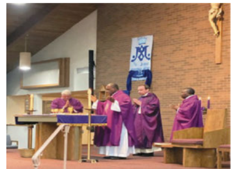
Together Mass at QM 2023