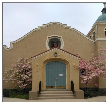
Corpus Christi Church