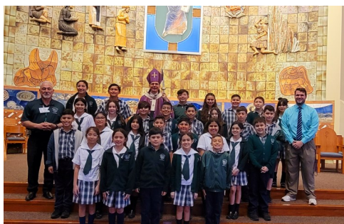
5th Grade Mass with Archbishop Gustavo