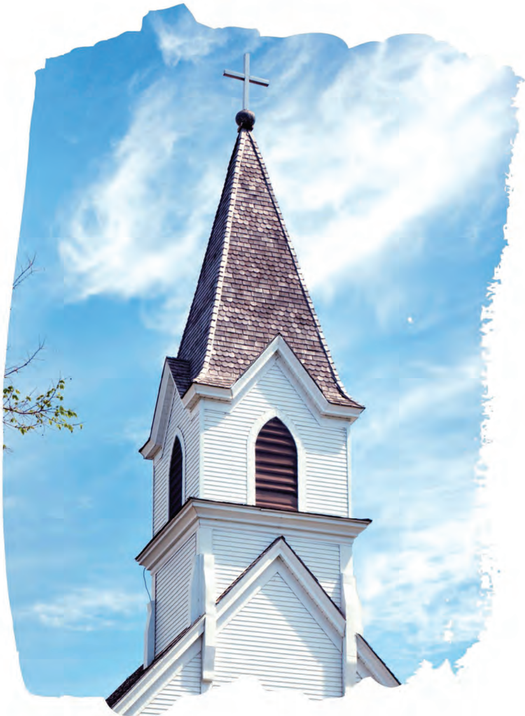
St. Gabriel Church Philadelphia, Pennsylvania