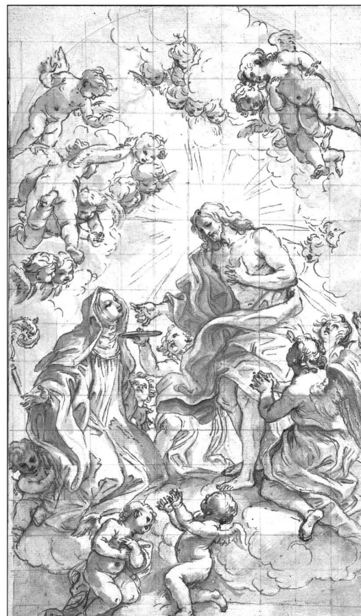
Above: "Christ Giving the Host to a Holy Abbess" pen, ink and chalk on paper, by Giovanni Battista Gaulli, 1690.