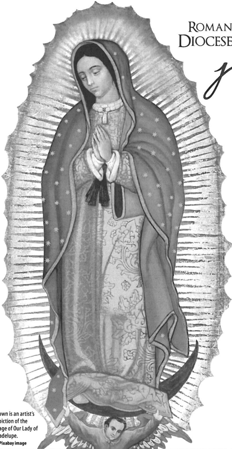
Shown is an artist's depiction of the image of Our Lady of Guadalupe.