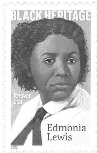
Edmonia Lewis, an African American and Native American sculptor who was Catholic, is honored on a stamp as part of the U.S. Postal Service's Black Heritage series, set for release Jan. 26, 2022.

— Dennis Sadowski, Catholic News Service