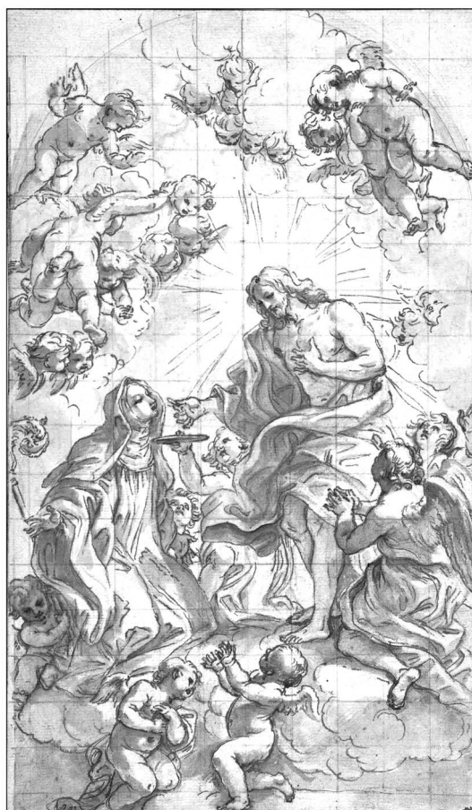
Above: "Christ Giving the Host to a Holy Abbess" pen, ink and chalk on paper, by Giovanni Battista Gaulli, 1690.