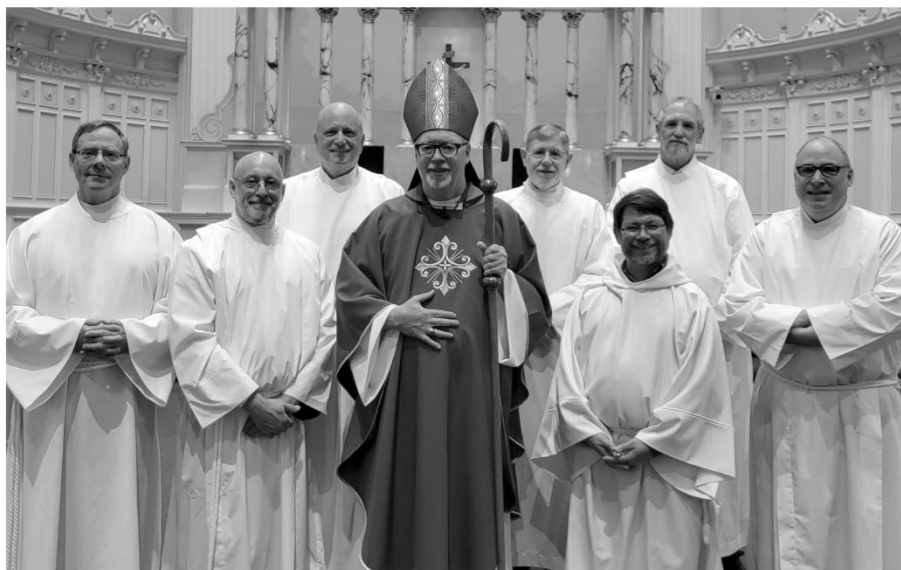
The seven deacon candidates received the order of acolyte by Bishop Christopher Coyne at the Cathedral of St. Joseph in Burlington on March 20.