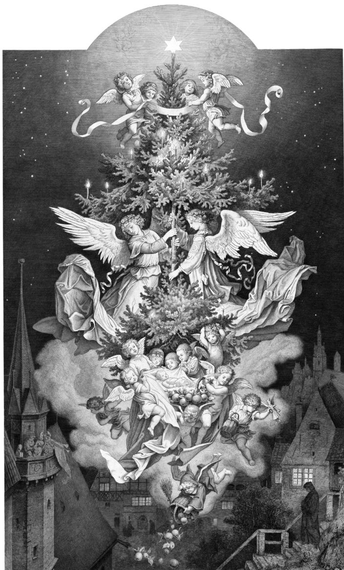
Shown is the wood engraving “Die Christnacht” by Ludwig Richter, 1854.

“Our Saviour, dearly-beloved, was born today: let us be glad. For there is no proper place for sadness, when we keep the birthday of the Life, which destroys the fear of mortality and