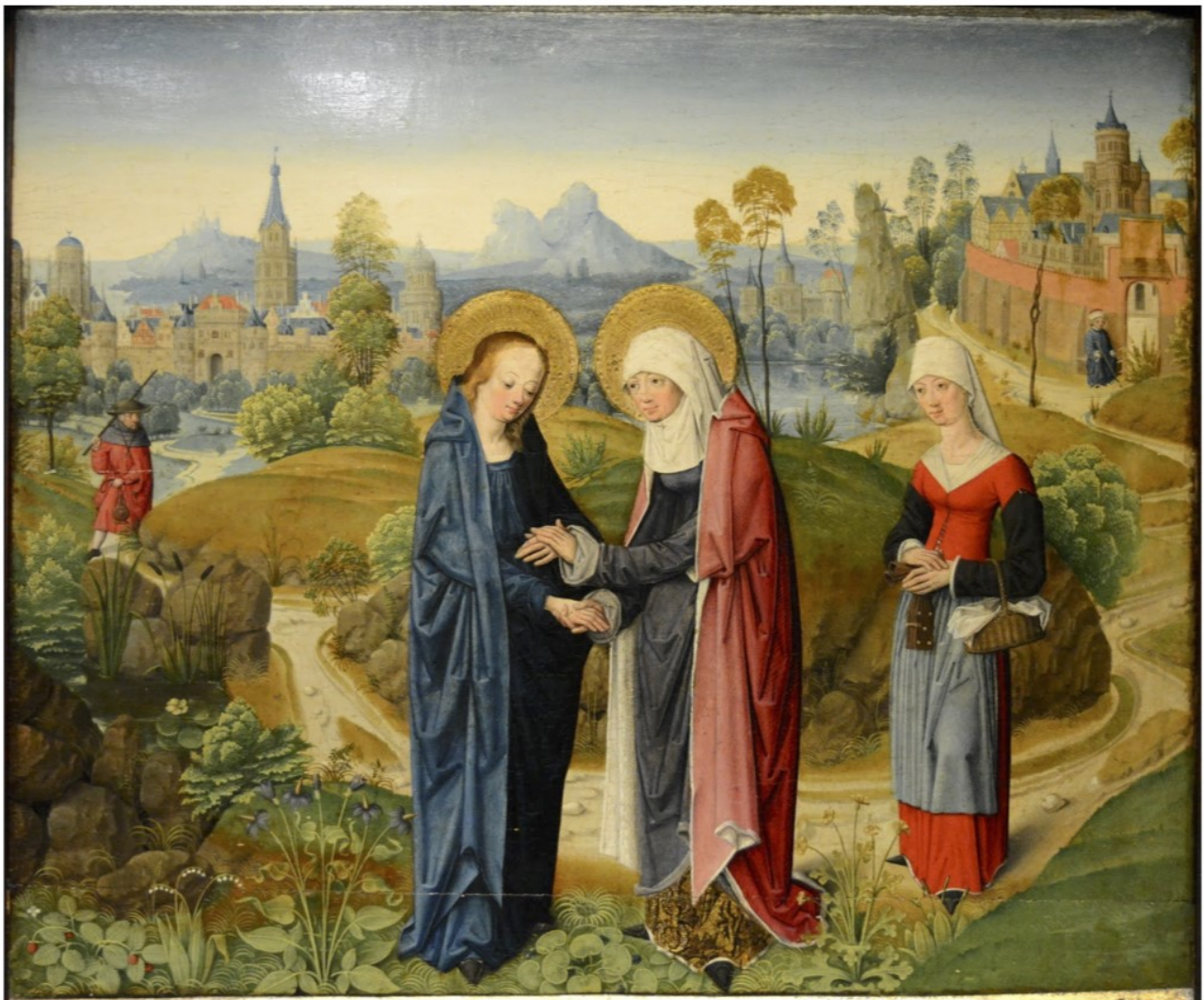
Masters of Aachen, Visitation , 1485.

We can and should trust what our eyes see in this world, but only to a certain point. We walk by faith, not by sight, as Saint Paul says (2 Cor 5:7), and while this does not mean closing our eyes to earthly responsibilities, it does mean that we can and should feel our way through this world by our God-given sense of trust in Jesus. Everything that we see, our bodies included, will eventually crumble, dissolve, and be rebuilt at the Second Coming of Christ in a spiritual manner perfectly coherent with what our faith sees now. So it is with the body of the Blessed Virgin Mary herself, which God assumes into heaven. So it will be with our bodies at the resurrection of the dead, so long as we greet Christ in faith now through the veil of flesh in which we walk.