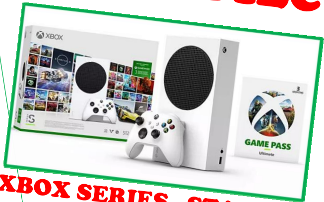
XBOX SERIES - STARTER BUNDLE