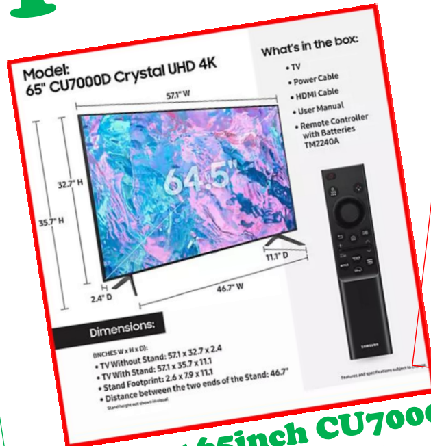
Samsung 65inch CU7000D Crystal UHD 4K