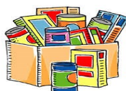
Feeding the Community

FOOD COLLECTION: Supporting Western Upper Montgomery County Help (WUMCO Help, this month's