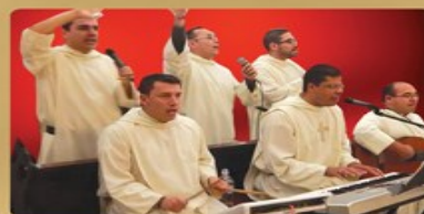
HERMANDAD DISCÍPULOS DE JESÚS SAN LUIS POTOSÍ, MX

ALABANZAS • EUCARISTÍA • CONFERENCIAS • HORA SANTA