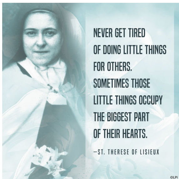
St. Therese of the Child Jesus, feast day Oct. 1