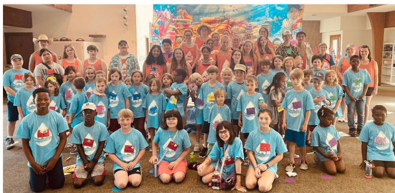
We had such an amazing group of students at VBC this year.