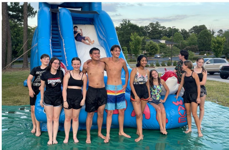
Special thanks for our TYM & JYM volunteers for VBC!