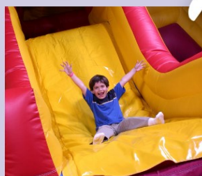
Blow-up slides & yard games for all ages