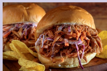
BBQ by the Knights of Columbus and MORE!