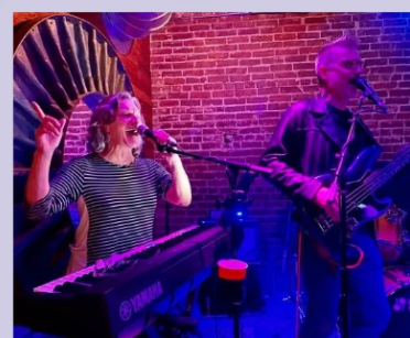
Live Music by The MixTapes