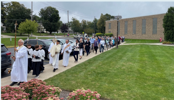
Eucharistic Procession 9/9/23