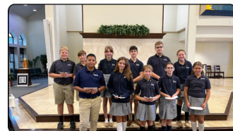
STUDENT COUNCIL 2023-2024

Please contact the Parish Office at 440-285-7051.