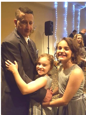
St. Mary's School Father Daughter Dance