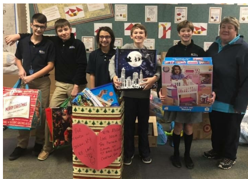
Toys Donated to Kids in Need in Kentucky