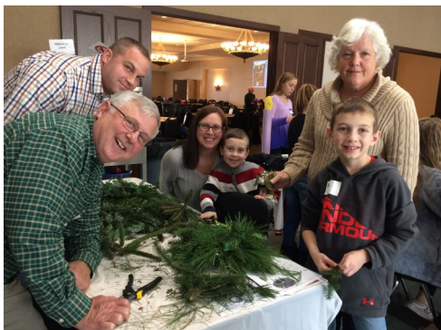
Families Make Advent Wreaths

We, the Roman Catholic community of St. Mary Parish under the patronage of our Blessed Mother, will proclaim, celebrate, and live out faith in God who is Father, Son and Holy Spirit and who sanctifies us in word and sacrament.