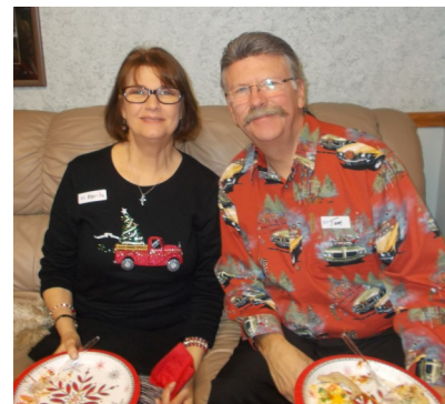
Empty Nesters Holiday Celebration