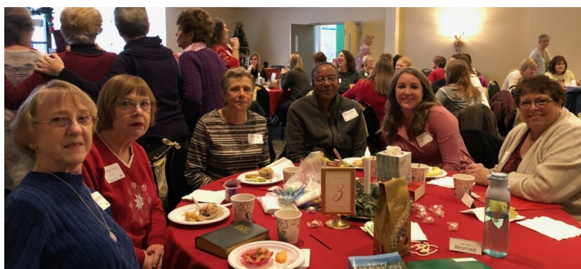
Ladies Advent Day of Prayer