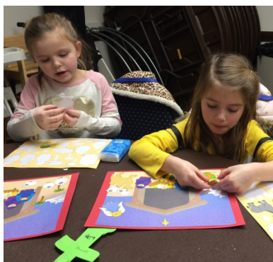
First grade PSR class makes Nativity pictures.