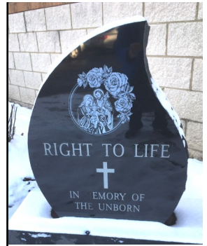
New Pro Life Memorial (above).

We invite anyone interested to come to our meeting on the second Wednesday of Sept., Nov., Jan., March and May following Eucharist Adoration in the Hospitality Room. Come see what we are all about. You need not make a commitment. Just come. †