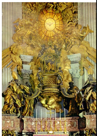
The Chair of Peter, located in St. Peter's Basilica

February 22 nd is the Feast of the Chair of St. Peter, Apostle