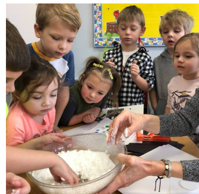
St. Mary's School PreK Makes Snow