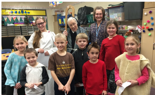
PSR Second Grade Nativity Skit