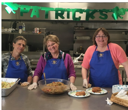
Knights of Columbus St. Patrick's Day Party