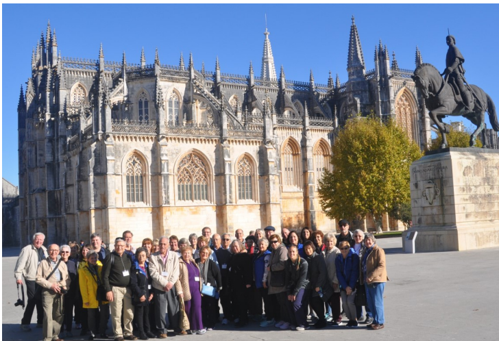
Monastery Cathedral Batalha, Portugal

"Through this holy anointing may the Lord in his love and mercy help you with the grace of the Holy Spirit. May the Lord who frees you from sin save you and raise you up." (CCC 1513)