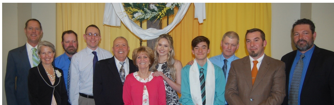
RCIA Members and Their Sponsors After the Easter Vigil