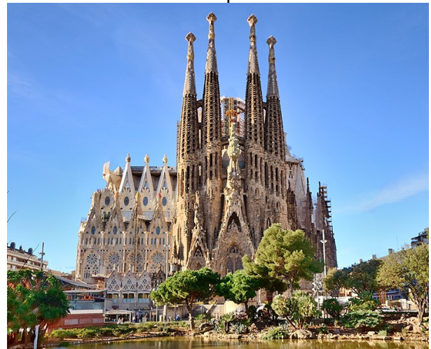
Sagrada Famillia Basilica Barcelona, Spain