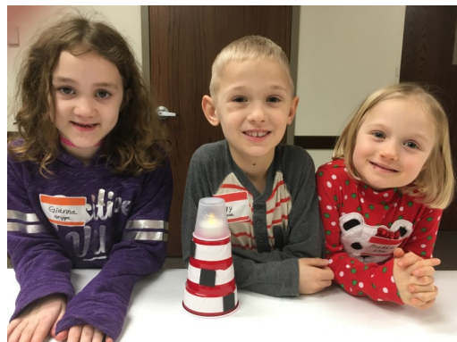
Kids Learn About Christ our Light at the Parish Lent Mission