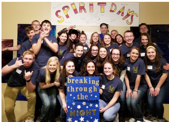
LifeTeen Members Present the Confirmation Retreat