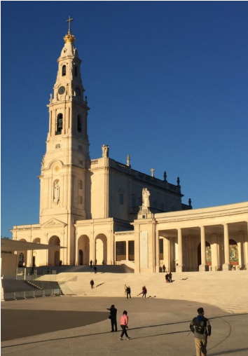
Basilica Fatima, Portugal