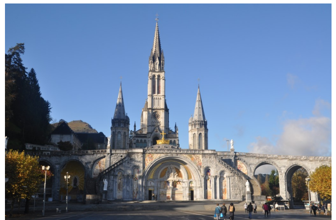
Basilica Lourdes, France