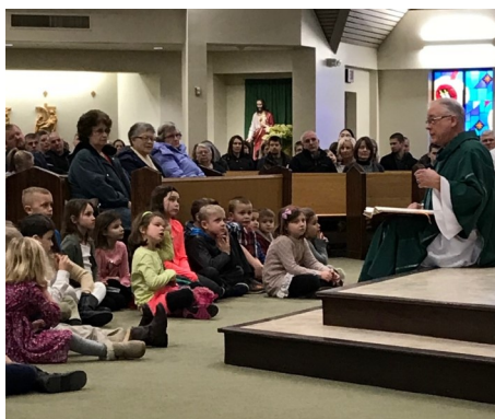
Children Listen Intently to the Homily at Family Mass