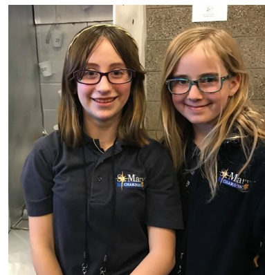
St. Mary's School Students at STEM Expo