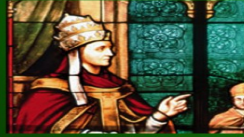
December 31st Feast of St. Sylvester I, Pope