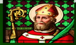
December 29th Feast of St. Thomas of Canterbury