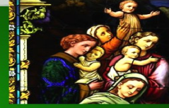
December 28th Feast of the Holy Innocents