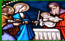
January 1st Octave Day of Christmas Solemnity of Mary, Mother of God