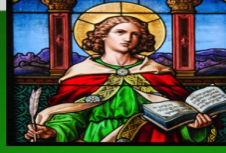
December 27th Feast of St. John, Apostle & Evangelist