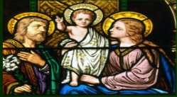
Sunday after Christmas or December 30th Feast of the Holy Family