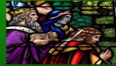
January 6th Solemnity of the Epiphany of the Lord