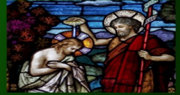
Sunday after Epiphany or after Jan. 6 Feast of the Baptism of the Lord