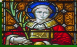
December 26th Feast of St. Stephen, First-martyr