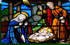
December 25th Solemnity of the Nativity of the Lord