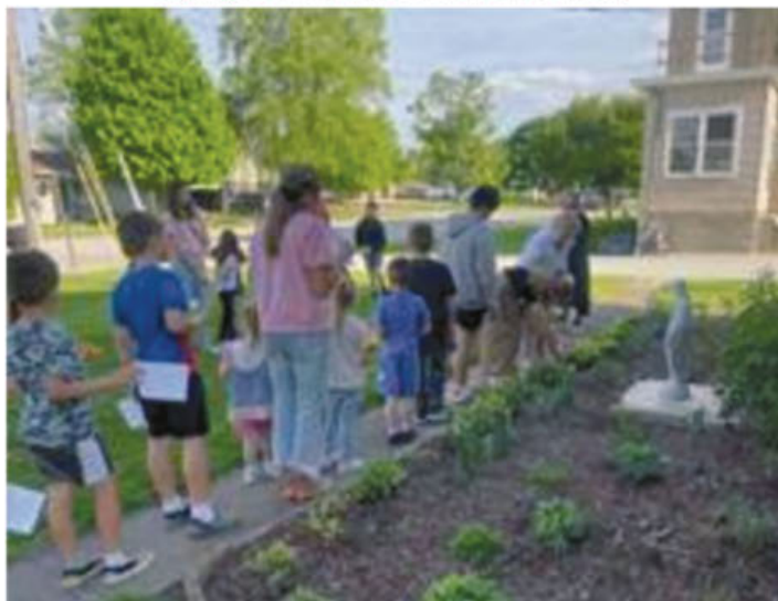
Laying down our flowers before Mary