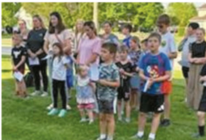
Singing "On This Day, Oh Beautiful Mother"