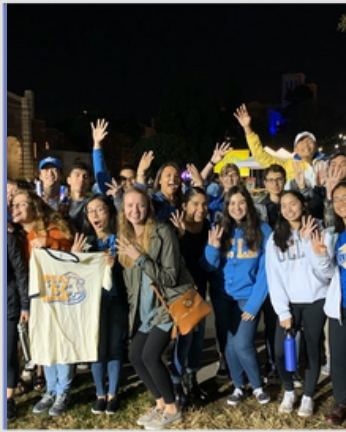
beat 'sc rally