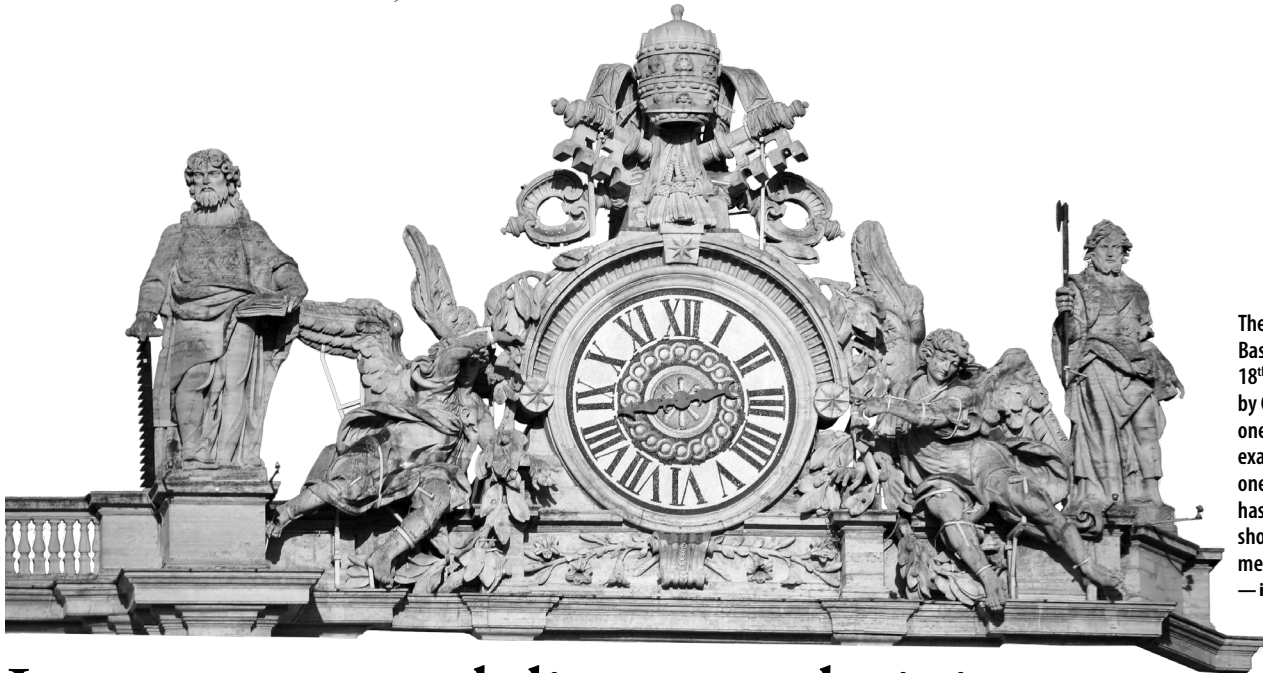
The facade of St. Peter's Basilica is flanked by two 18 th century clocks, built by Giuseppe Valadier. The one on the left shows the exact time in Rome. The one on the right (here) has a single hand, which shows the European mean time.