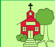
St. Michael the Archangel Preschool

Congratulations to our Graduating Preschool Classes! We will miss you! God bless you all!