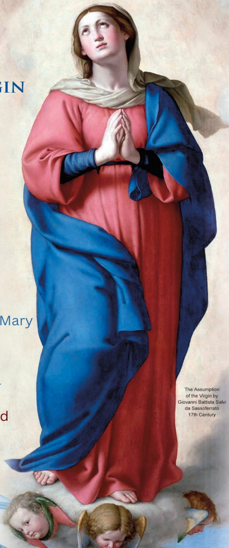
The Assumption of the Virgin by Giovanni Battista Salvi da Sassoferrato 17th Century

6:30am, 9:00am, 12:00pm, and 7pm (Bilingual)