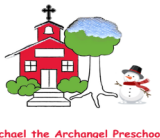
St. Michael the Archangel Preschool

1/18 - 3 year old parents Open House for Pre-K