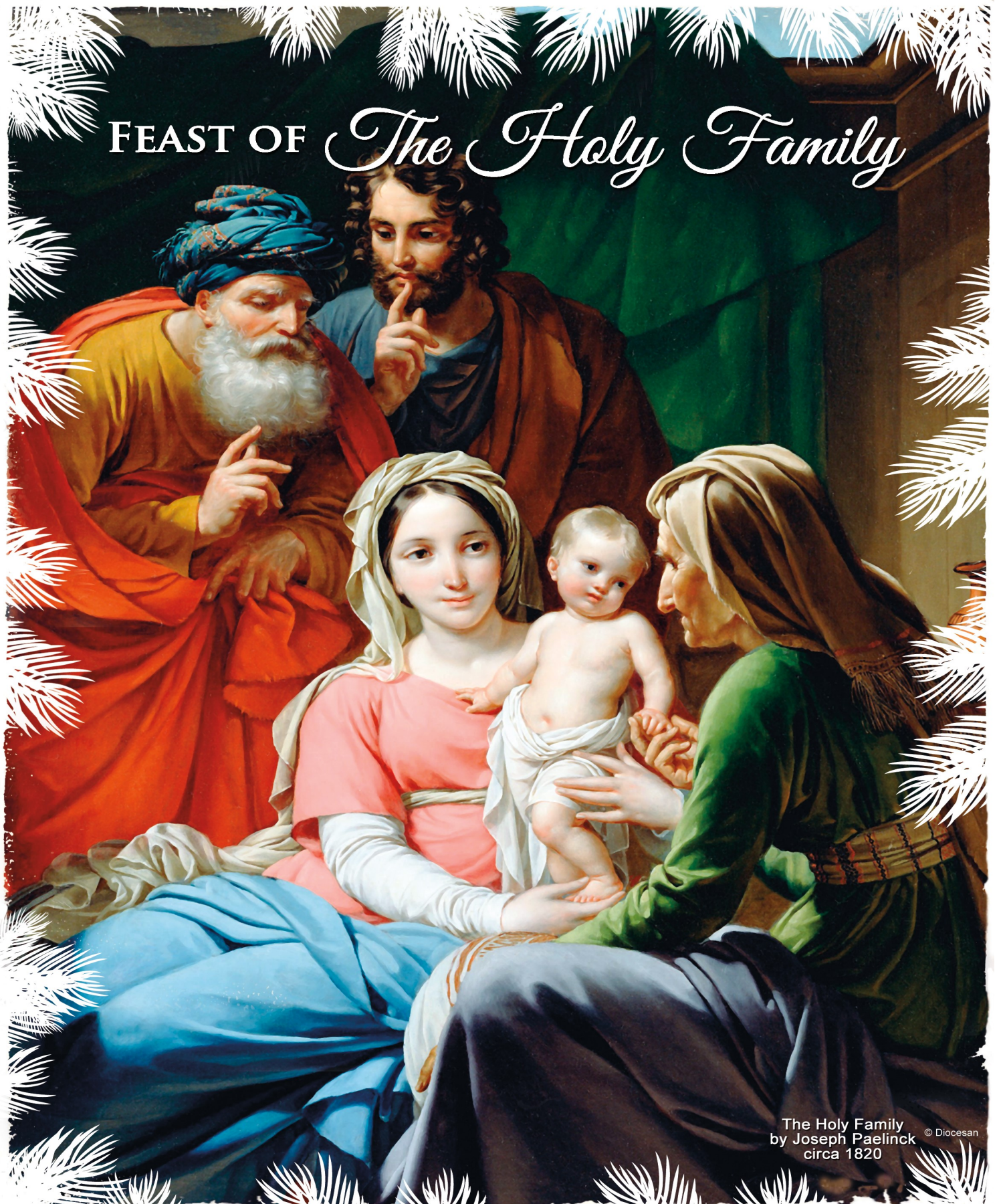
The Holy Family by Joseph Paelinck © Diocesan circa 1820