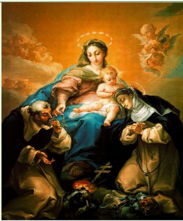
Vicente López, Vergine del Rosario in gloria con i SS. Domenico e Caterina da Siena, 1800, Coll. privata