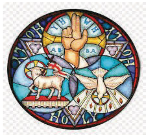
THE MOST HOLY TRINITY

New Parishioners are always welcome. Please stop by the Parish Office to register at your earliest convenience.