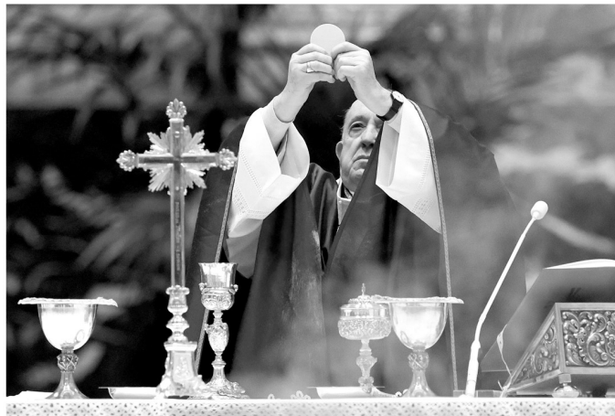
Pope Francis elevates the Eucharist as he celebrates Ash Wednesday Mass in St. Peter's Basilica at the Vatican Feb. 17, 2021.

The way back to God, he said, starts with understanding, like the prodigal son, how "we have ended up with empty